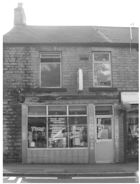
Existing shop front